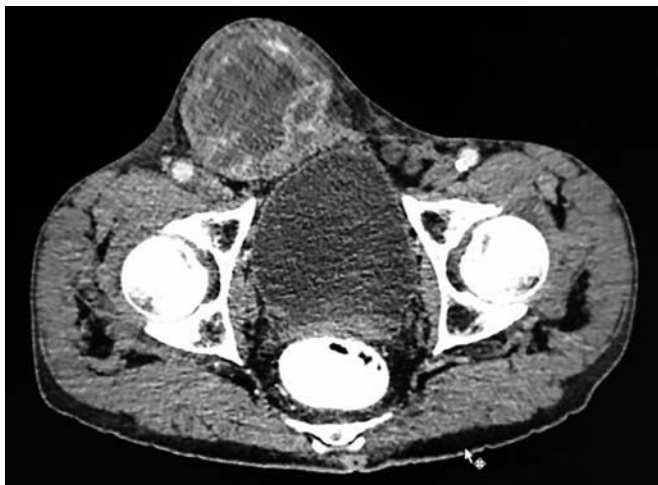
Fig. 2: CT scan of abdomen and pelvis which shows a heterogeneous mass arising from the right inguinal canal.

region, a heterogenous globular lesion 7 x 8 x 8 cm in size was seen arising from the inguinal canal. The cord structures could not be visualized clearly. Radiologist's impression was that of a lymph nodal mass, possibly a lymphoma. Abdomen and testis were normal. CT scan of the abdomen and pelvis was done and showed similar findings, with no evidence of metastasis (Fig. 2). FNAC was done, but the smear did not identify any representative tissue. A working diagnosis of a lymph nodal mass was made and the patient posted for surgery.