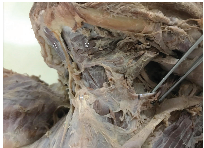
Fig. 2: Unilateral absence of anterior belly of digastric. A: Anterior belly of digastric; H: Hyoid bone; M: Mylohyoid; I: Intermediate tendon